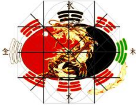
NMS Circular Manual & DVD

Martial Sciences (Combat Technology) -Martial Sciences are about combat and survival. It is not about sport or some sort of consensual fair fight between gentlemen. Because of this, the attacker will probably use weapons and even if the attacker does not, you'd be foolish not to use a weapon if you could. Combat is also about shut down the opponent/offense - you must take the fight to him even while avoiding his attack (indirect attack). Only offense brings victory. Defense just delays the inevitable victory of your opponent.